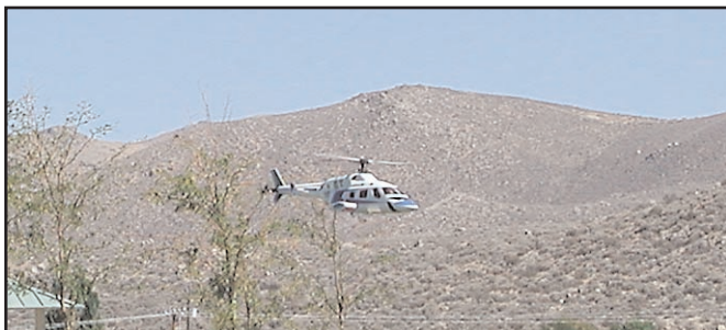
A very nice looking IC powered Heli, that was flown very nicely at the Jr. Air Races. I didn't get the pilot's name.