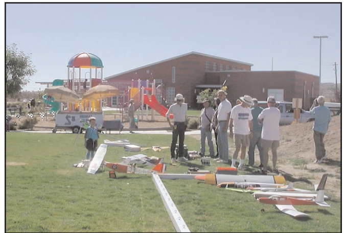
Some of the planes and participants of the Jr. Air Races.

The event isn't really a race at all, just a bunch of guys flying RC planes. The Reno RC club was there flying IC planes, and there were some control line pilots flying at the end of the grass field we were at.