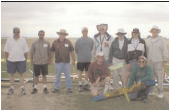
S3 members at Spring Fling 2002

S3 made a strong appearance at this year's Spring Fling in Sacramento on June 22-23. Ten members made the trip over the hill to participate in a contest with better than average weather and poorer than average attendance.