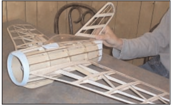
Adam's new Turbo Bee. Should be very cool