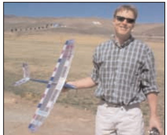
Stick an Astro 010 in a mini hand launch fuse (courtesy of Chris Adams), build a wing and tail out of $2.00 worth of balsa, and you have a sweet 10oz aerobatic motor glider. (This is version 2)

This could have been a picture of your latest airplane, if only you had sent it to the newsletter editor.