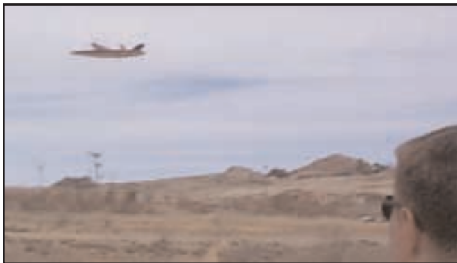
Low wing slowflyer in the air at Ranch San Rafael