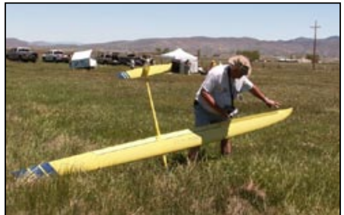
Lee Cox checks the aileron on his beautiful Sharron

The conditions seemed like they were going to be ideal, but the wind started blowing early...lightly at first, but it steadily increased throughout the day. The thermals, when you could find one, were very strong and the