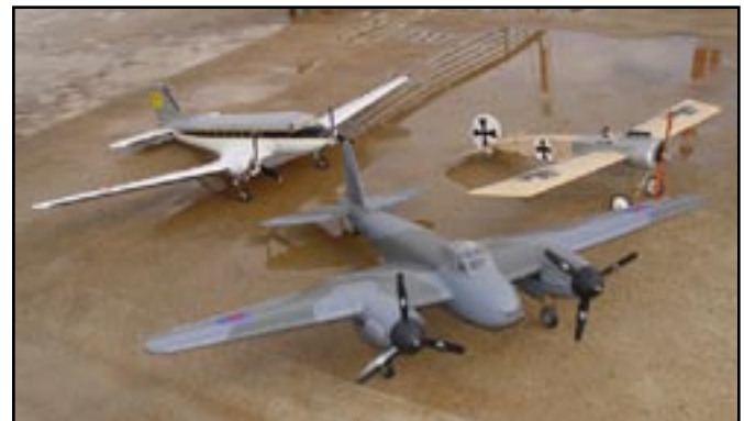
3 very nice scale electric planes sitting out in the rain. I saw the WWII Mosquito (in front) fly at the hands of Steve Neu.