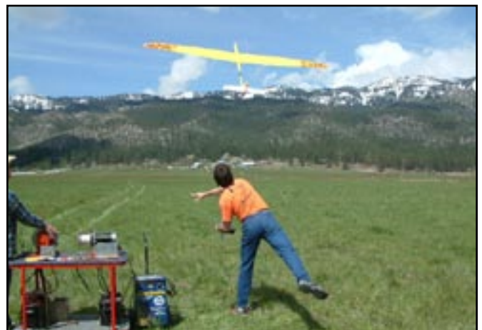
Oliver launching in perfect form at the April contest held in May

Pete was the CD for the April contest. The contest was twice rescheduled due to bad weather. We finally flew the contest on May 7.