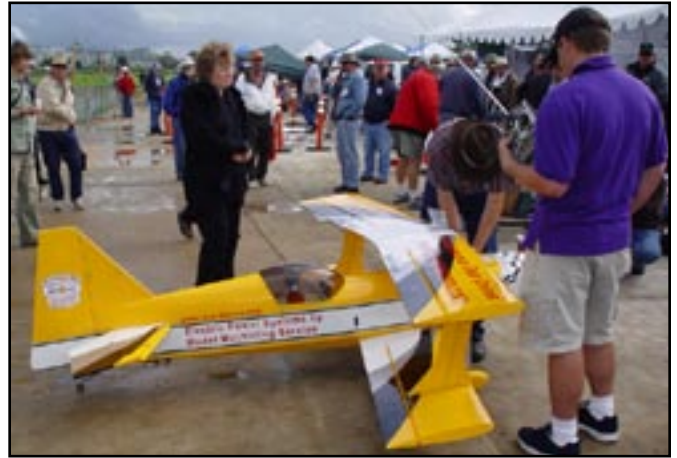
46% Ultimate Bipe. with a 32" prop powered by 4 large Hacker motors on an inner driven gearbox and a really expensive wad of Thunder Power LiPoly batteries. This plane hovered on the prop at about 2/3 throttle.

Here are some pictures I took at the San Diego Mid Winter Electric show in February. Unfortunately it rained the entire weekend, so the event wasn't as well attended as in the past. I brought my Pterodactyl, which drew a good crowd and made me very popular for about 20 minutes.